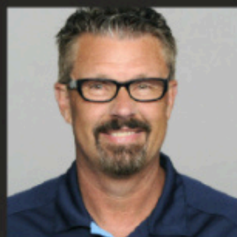
Gregg Williams Defensive Coordinator, Tennessee State, former NFL Head Coach, Buffalo Bills, NFL Super Bowl Champion XLIV, New Orleans Saints